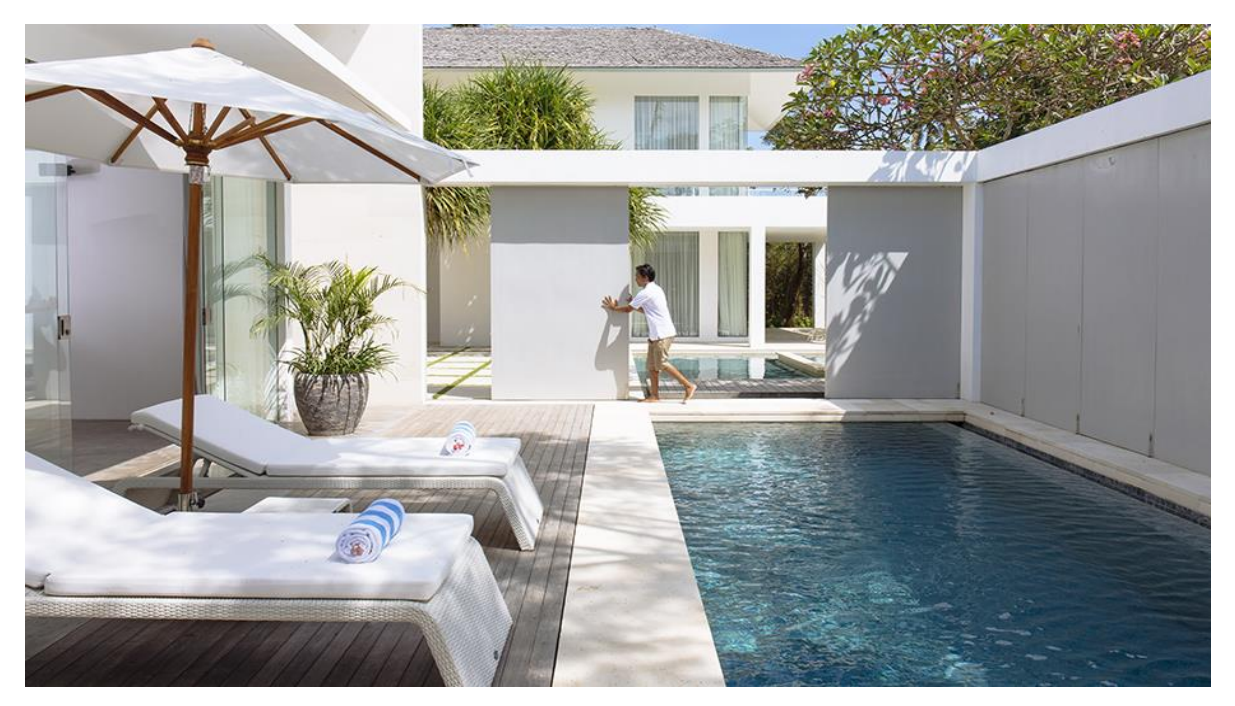
With its versatile sliding walls, Villa Canggu can transform to become an enormous 6-bedroom estate...