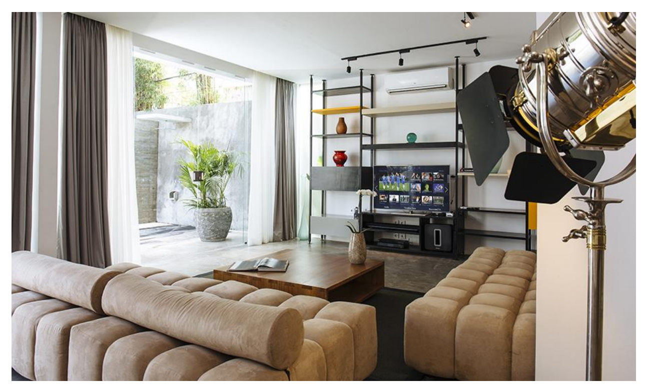
Villa Canggu pushes all the right buttons for any interior addict...

And as stunning as the villa's surrounds are, its interiors are equally as amazing. Laced with private collections of contemporary Indonesian art and framed by ultra-modern architecture, Villa Canggu could easily be at home in Malibu or downtown Venice Beach. Colourful paintings, murals and installations dot the fresh white-wash spaces, including a fascinating futuristic sculpture of a ship that's suspended from the ceiling. Bright, intelligent and stylishly modern, this villa pushes all the right buttons for any interior addict.