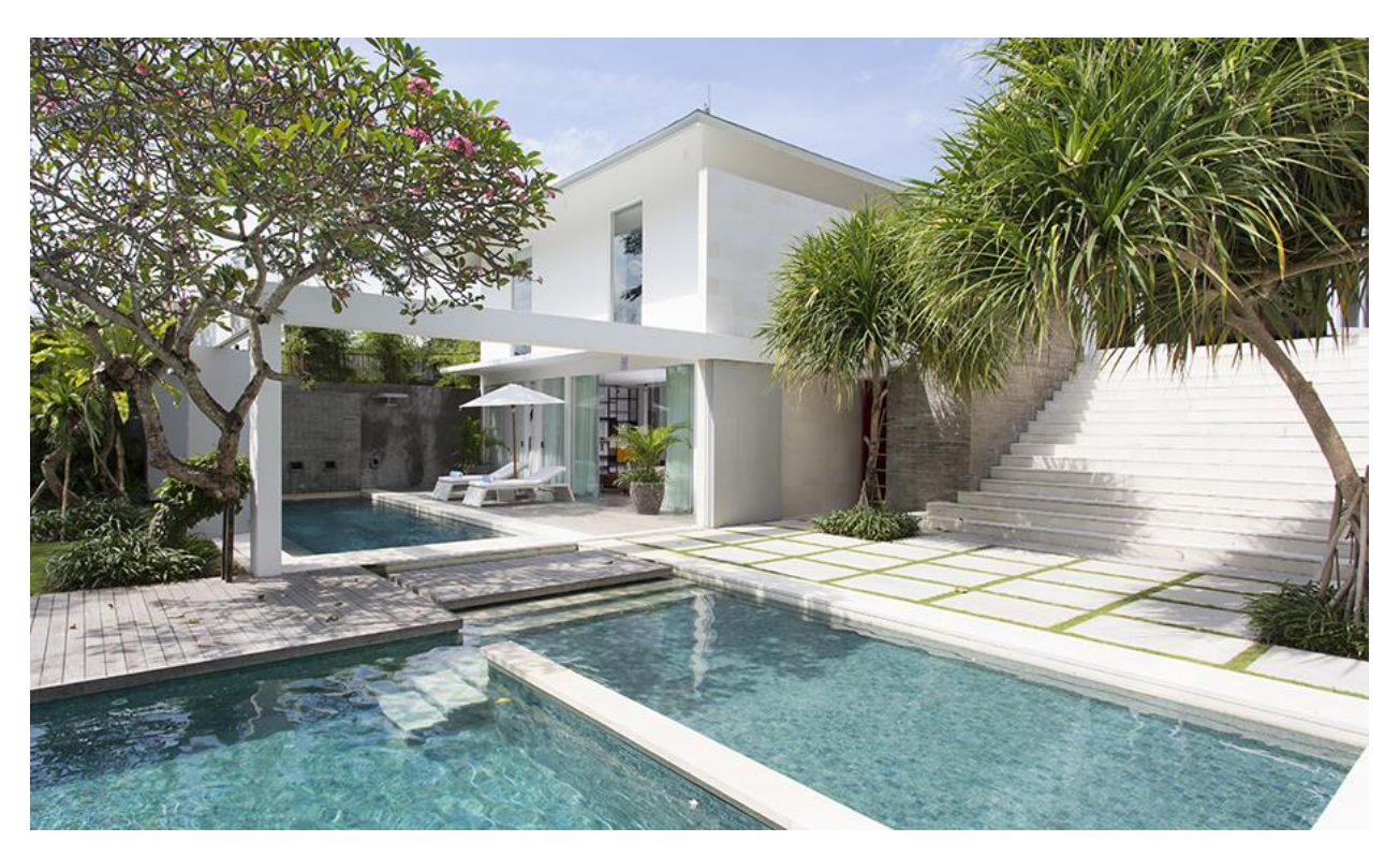
We LOVE Villa Canggu and its spectacular, contemporary interiors...